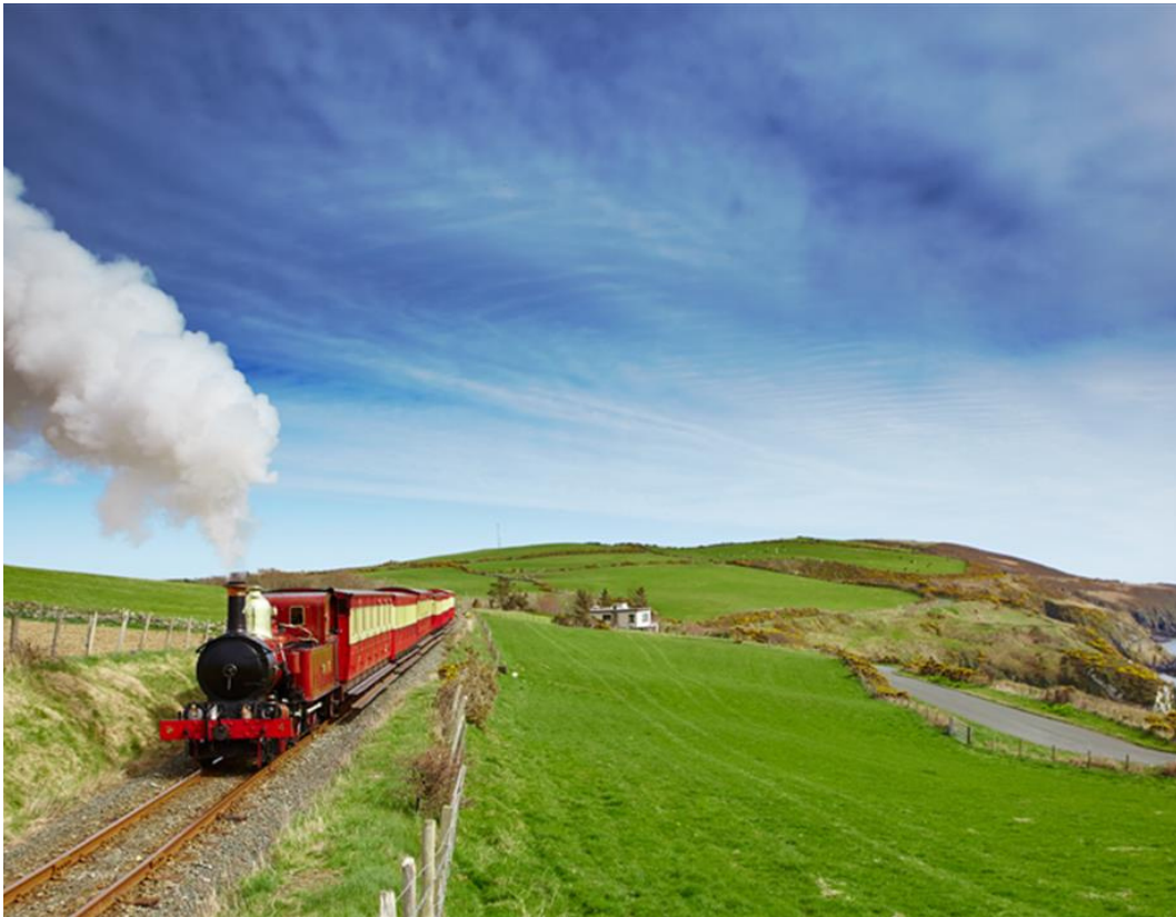
Visit Isle of Man

Hop on the Victorian steam train between Port Erin and Douglas, and perhaps take the dining carriage with a fireman's brunch or an afternoon tea on the way.