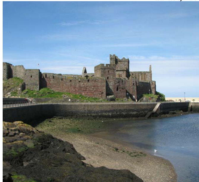
Visit Isle of Man

Grab a bite at the Fish Bar as you reach the promenade: A Kipper Bap is a favourite here. Or sample The Boatyard (Dog friendly), Harbour Lights , or a coffee at Roots by the Sea