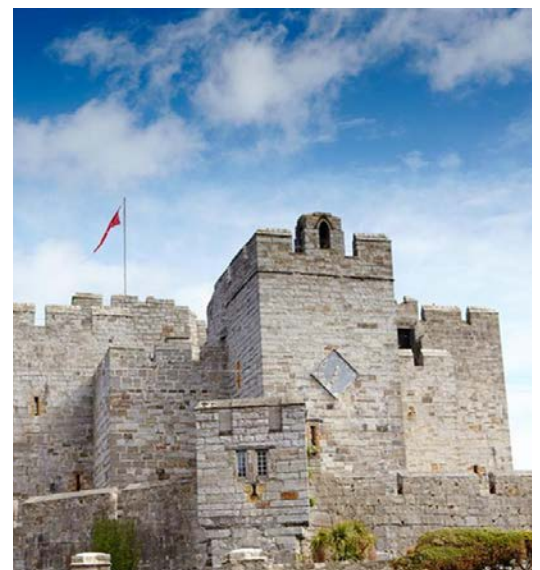
Visit Isle of Man

https://manxnationalheritage.im/get-involved/membership/