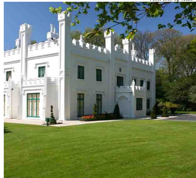
Visit Isle of Man

https://www.milntown.org/the-estate-325494/