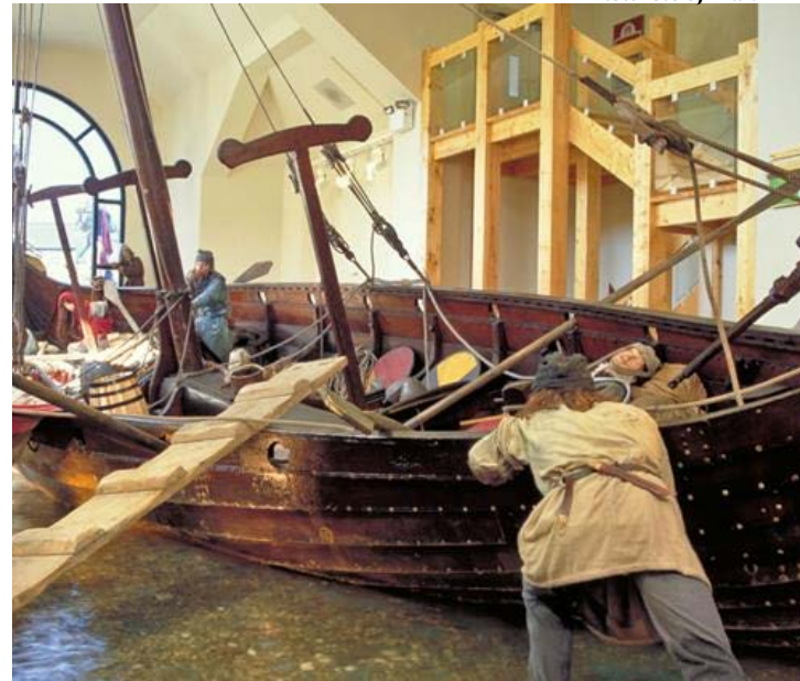
Visit Isle of Man

https://manxnationalheritage.im/our-sites/house-of-manannan/